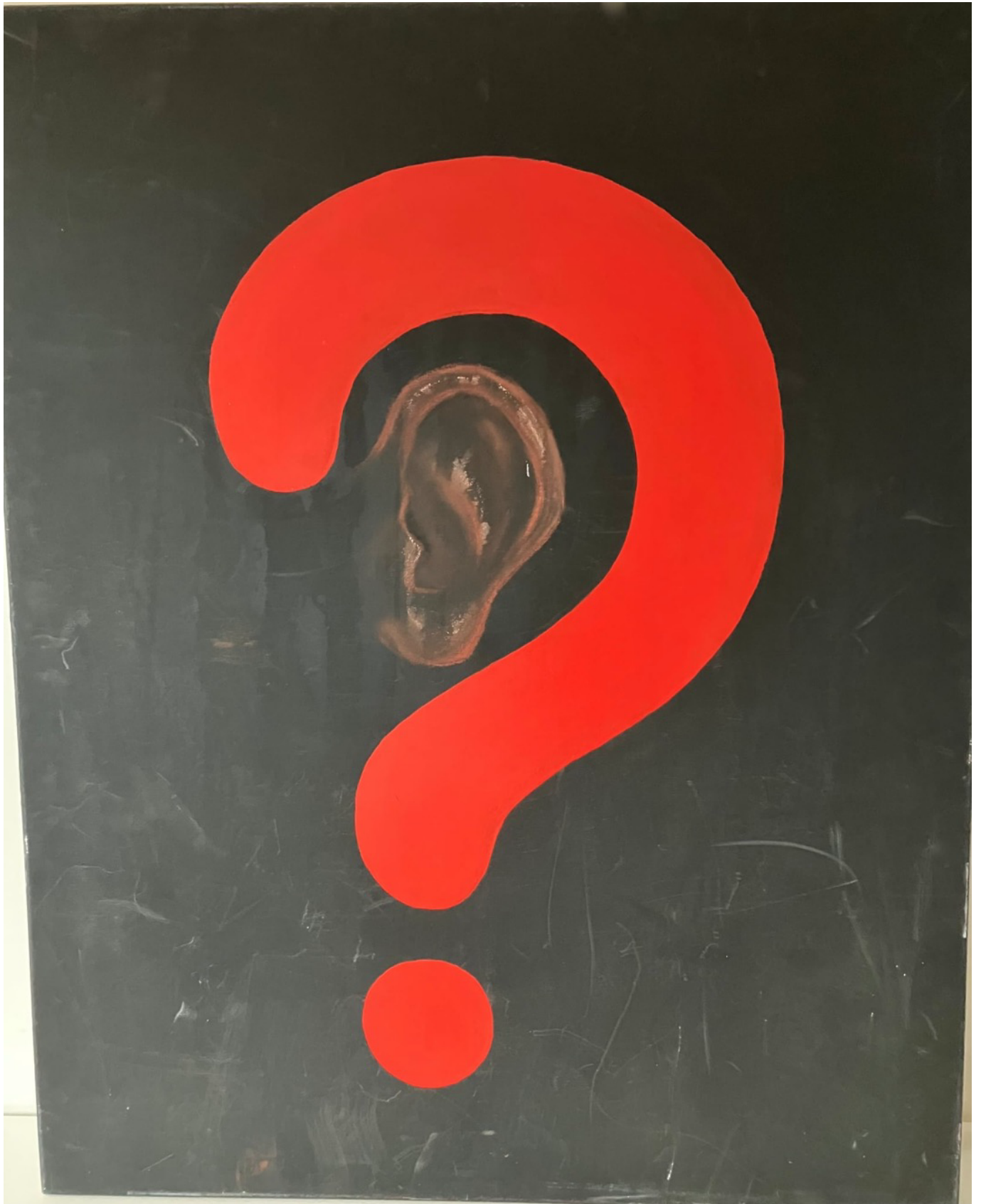
Painting of an ear surrounded by a large question mark. What are we listening to? What do we hear? What if we are deaf?